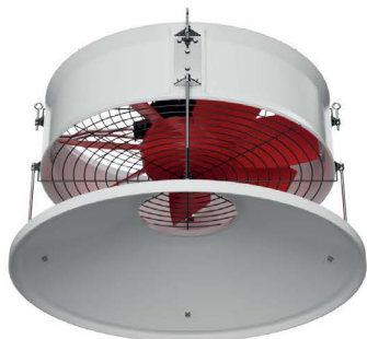
TEC VTM 8FV