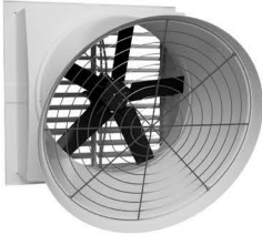
TEC VT 15 / 18 / 20